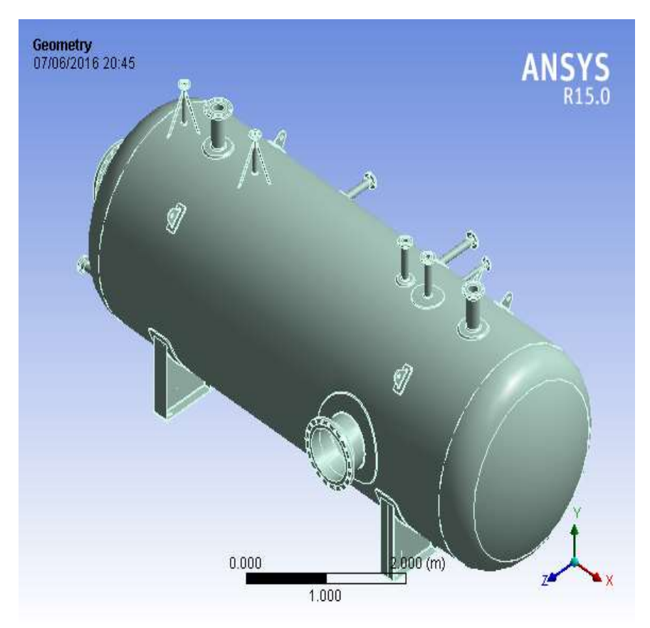
Fig. 2: 3D ANSYS MODEL